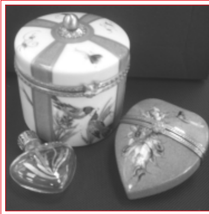
Powder Box ($360) and the Heart ($290)

Discover our Limoges Collection, choose from the following six designs: Royal Simple Sphere with 3 miniature perfume bottles ($575), Heart ($290), Faberge (standing) Egg ($375), Egg (large size) ($270), Powder Box ($360) and Sphere in Holiday Decor with 2 miniature perfume bottles ($350). Reserve your "Boites a Parfums".